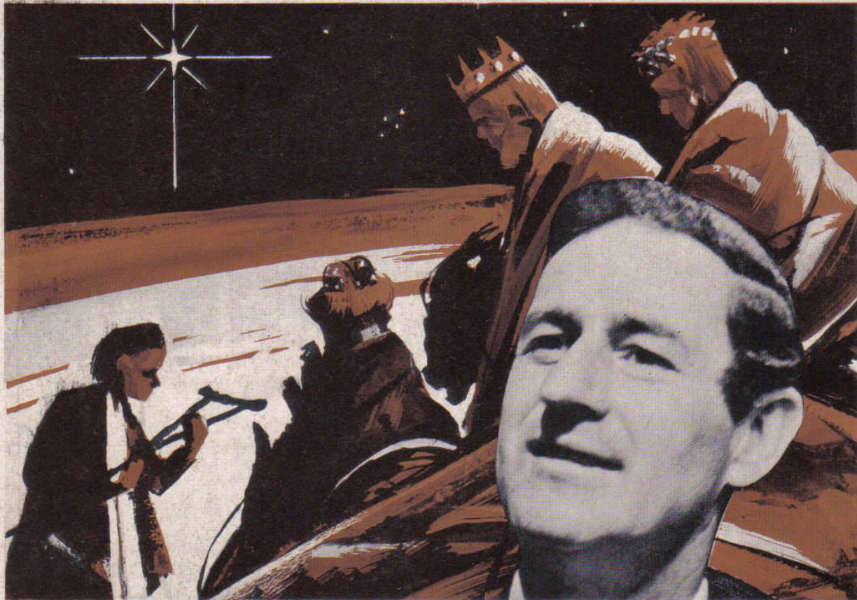
MUSIC'S MOST MEMORABLE MOMENTS . . . ONE IN A SERIES

When changing your address, be sure to send us your name and address as shown above as well as your new address.