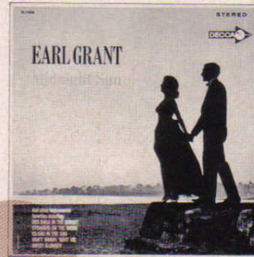
MIDNIGHT SUN Earl Grant at the Hammond Organ Decca DL 74338